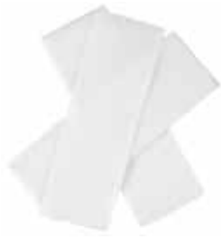
Isolation Film Polyethyleen