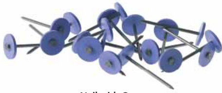
Nail with Cap