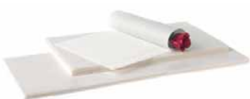
Corrugated Paper for Roses